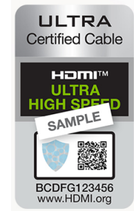
Label on packages